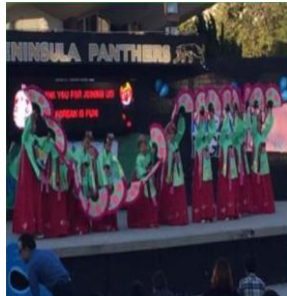
On Friday, May 12, 2017, the Amphitheatre of Peninsula High School was filled with students, parents, staffs, and community members celebrating the first-ever PVPHS Korean Culture Night. Everyone enjoyed delicious traditional foods sponsored by Bibigo and fabulous entertainment, and all 22 members of Peninsula Korean Honor Society members took an active role in planning, volunteering, and participating in performances.