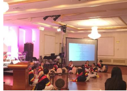
KHS students participated in the Hope Club Fundraising Event in June 2016.