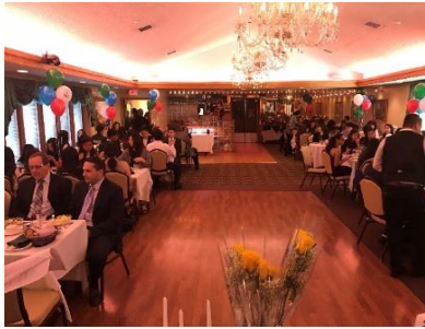
13 new members were inducted at the KHS Induction Ceremony on April 12 th , 2017.