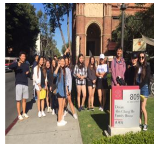
On March 29, 2017, students in Korean 1 and 2 took a field trip to University of Southern California and attended a Korean class. Students had a chance to stop over at Dosan Ahn Chang Ho's family house and learned its brief history.