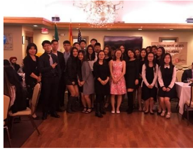
All KHS members took a group photo at this year's KHS Induction Ceremony.