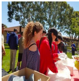
KHS supporting the Academic Fair of PVHS On February 14, 2017