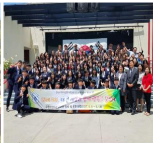
On May 9, 2017, KHS collaborated with ASB to organize a SAWL (Suwon Academy of World Language) visit to PVHS.